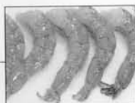
Hand peeled using manual labor.