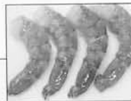
Machine peeled using Laitram Machinery.