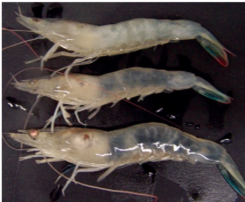
These juvenile Penaeus vannamei exhibit muscle necrosis, especially in the abdomen, due to infection by PvNV. The top shrimp shows severe generalized necrosis and opacity, while the others have more defined areas of muscle necrosis.

M uscle necrosis in shrimp often results in the appearance of opaque white lesions in the tail muscle in response to environmental factors such as low dissolved oxygen, sudden changes in temperature or salinity, or other stress. Severe hypoxia, a shortage of oxygen in tissue, can occur in the terminal phase of many infectious diseases and result in necrosis of abdominal muscles. White muscles in shrimp also can result from advanced infections by microsporidians belonging to the genera Ameson and Agmasoma , or dietary deficiency of selenium.